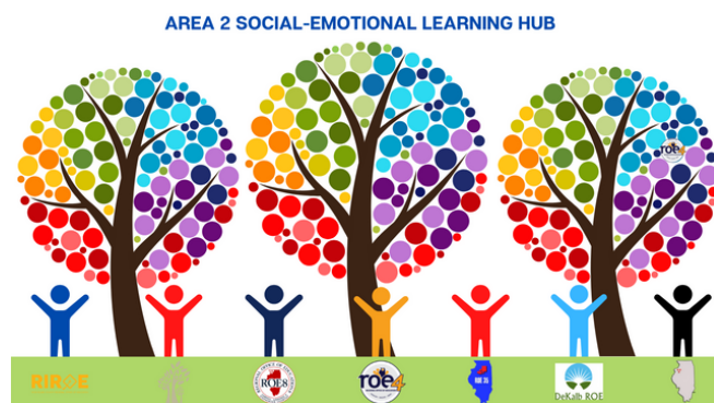
Pictured: Area 2 SEL Hub Logo Created by ROE 4 Communications Department

Boone-Winnebago ROE 4 began FY22 being selected as the headquarters for the Area 2 Social-Emotional Learning Hub. One of only 7 hubs in the state, the Regional Office started off strong as a power player in this newly created Illinois State Board of Education initiative. Funded entirely by the ESSER Grant, the Regional Office dove head first into the expansive framework that would bring FREE high-quality professional development, SEL coaching and support, and innovative student and staff learning opportunities to every district in Area 2.